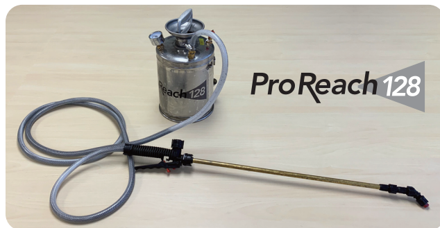
ProReach128 (one gallon) long reach sprayer accessory available for above ditch applications